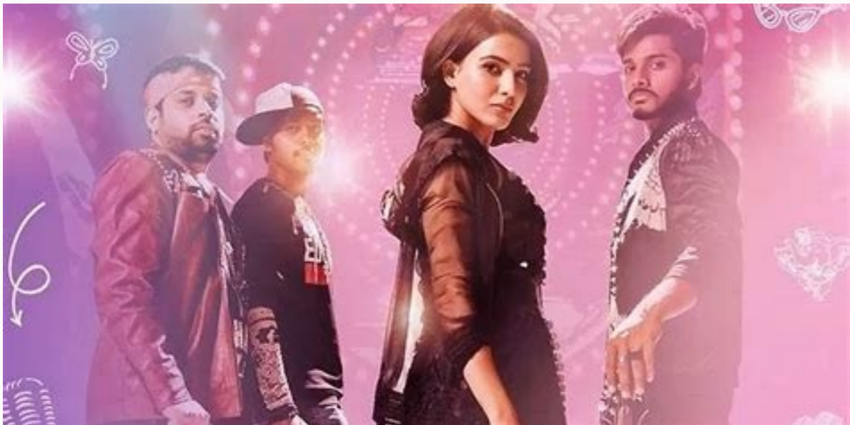
Cute baby songs in telugu movies. Baby girl birthday songs in telugu movies. Baby boy songs in telugu movies. Baby songs in telugu movies list. Baby girl song in telugu movies.